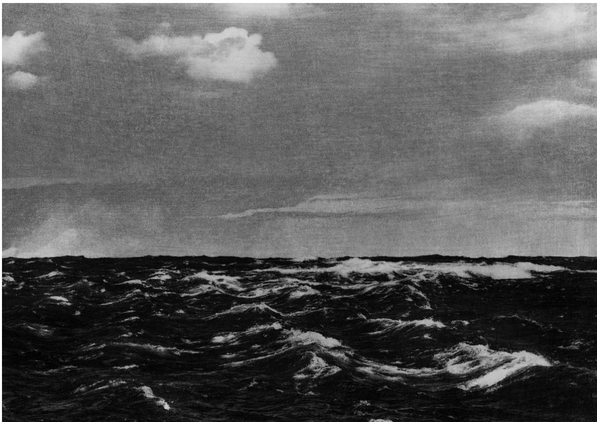
Jungjin Lee, Voice #7 , 2019. Courtesy Howard Greenberg Gallery