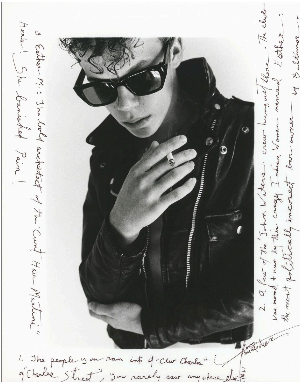
© Estate of Amos Badertscher, 'Club Charles' on 'Charles Street' oh!, + Esther, too, 1984.