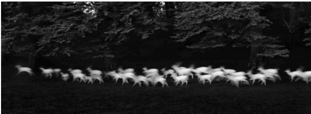
Paul Caponigro, Running White Deer, Co. Wickland, Ireland , 1967.