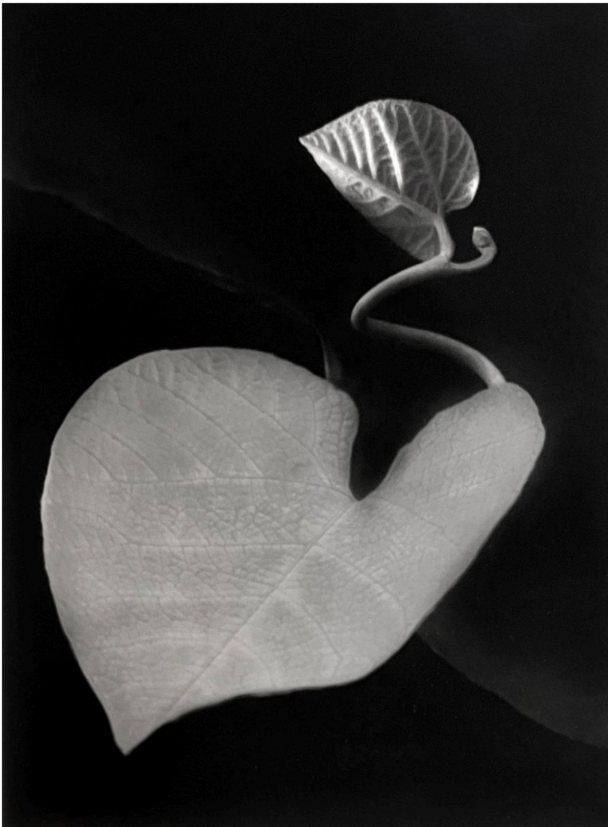
Paul Caponigro, Two Leaves , Rochester, NY, 1963.