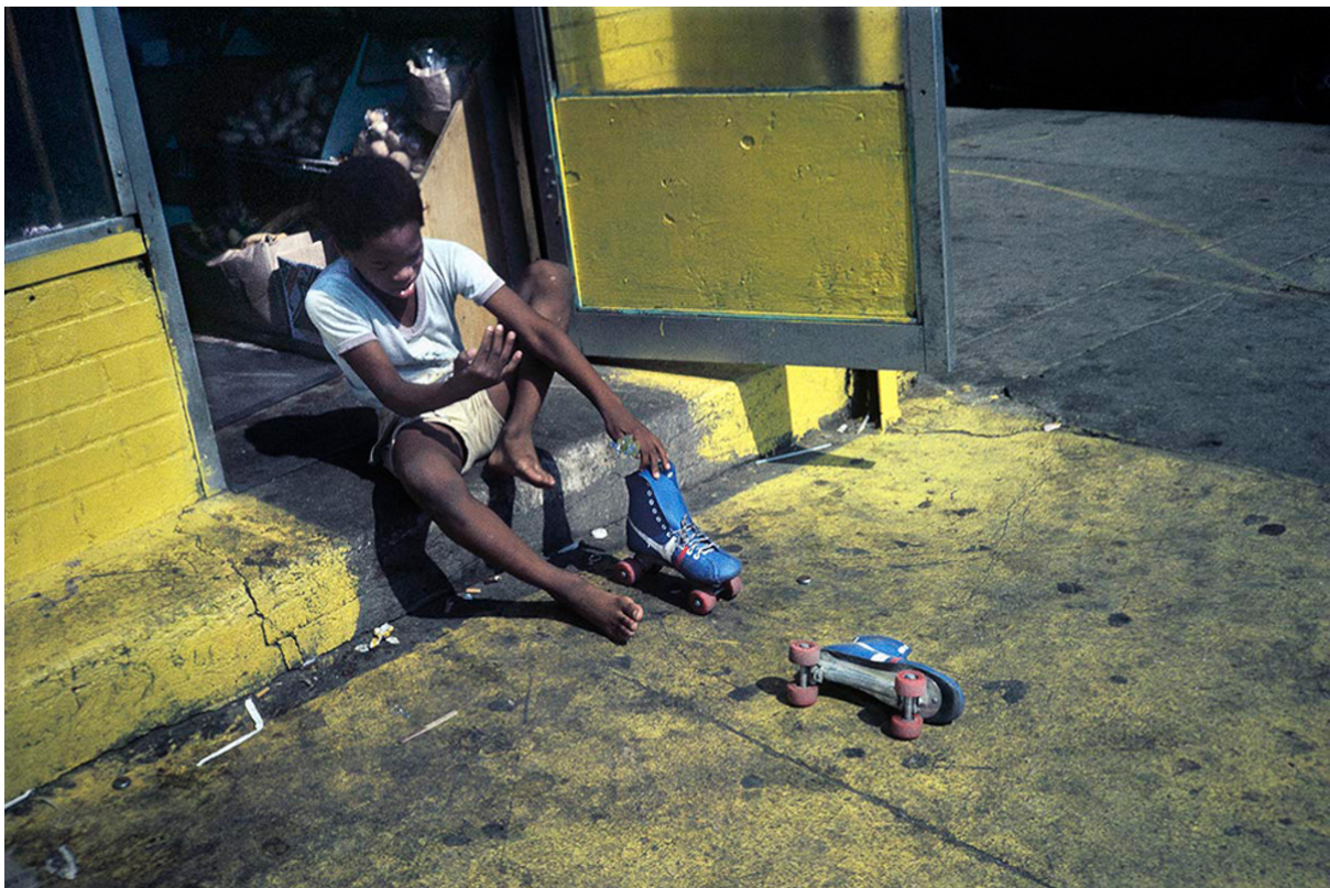
© Meryl Meisler, Roller Skates, Bushwick, Brooklyn, NY, c. 1984 .