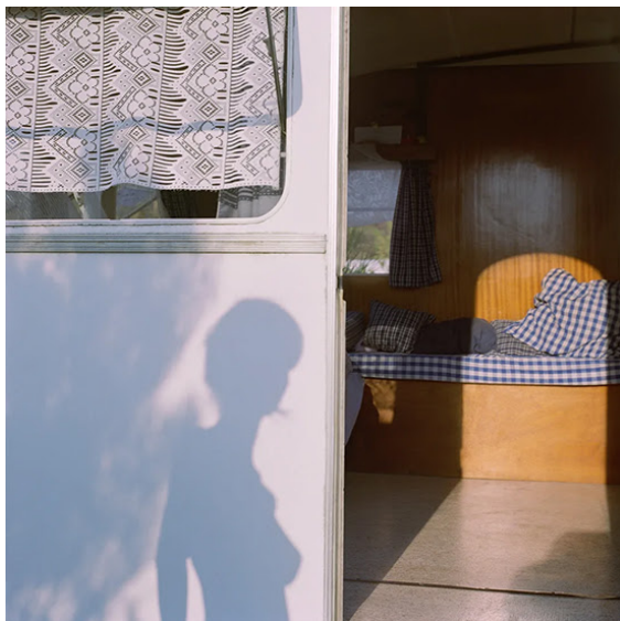
Mona Kuhn, Blues , 2008.