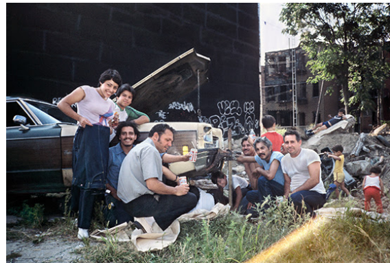
Meryl Meisler, Family Picnic Palmetto Street, Bushwick, Brooklyn, NY September 1982.