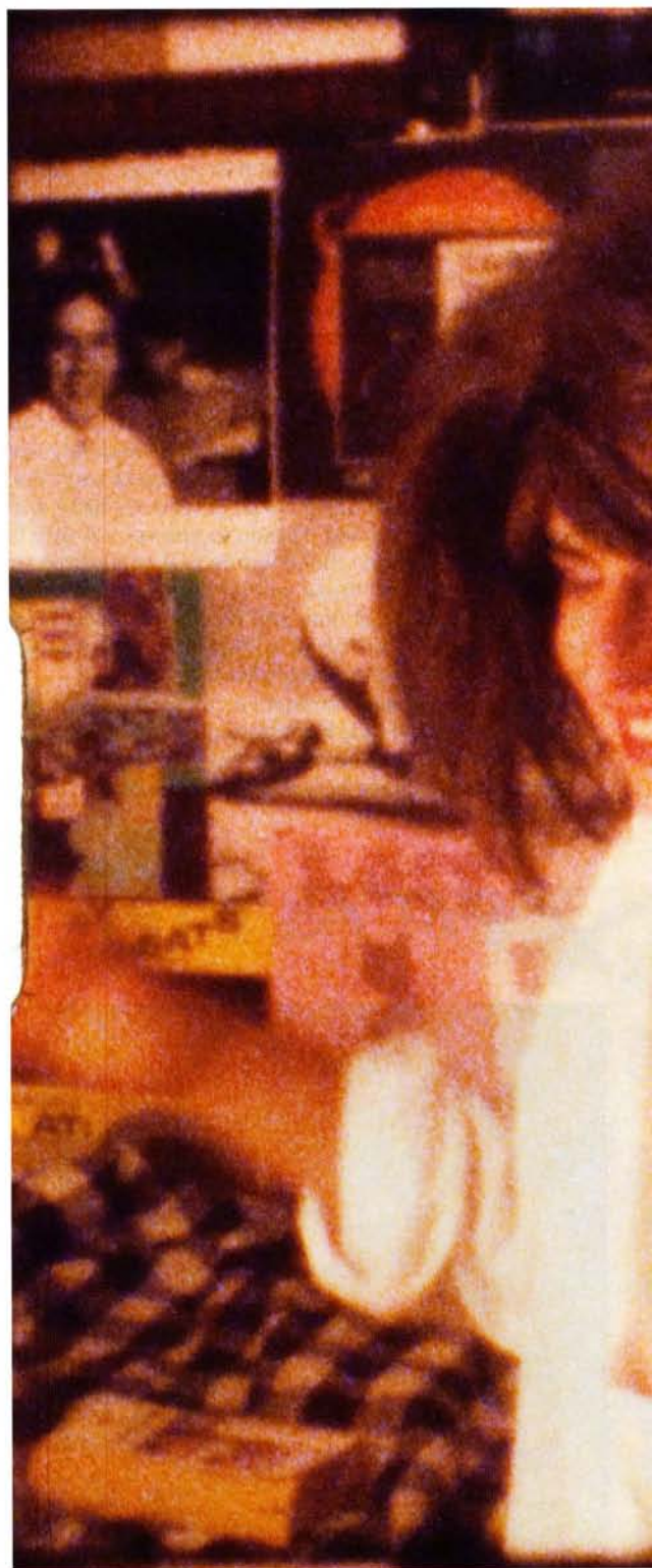
The Laziest Girl in Town , 1981, Super 8 film, approx. 23 minutes.