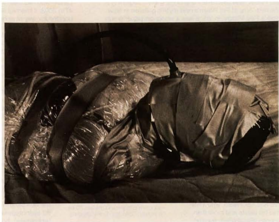
Above, Untitled , ca. 1981, toned gelatin silver print, 13 by 19 3/4 inches.

showed relatively straightforward black-and-white prints in which the dominant influences seem to be Diane Arbus and Robert Mapplethorpe. The most shocking of them is a shot of someone in bondage, his head and body tightly wrapped in plastic and packing tape, and a single breathing tube allowed. Next to this hung a portrait of a wholesome blond boy and cute dog, like something out