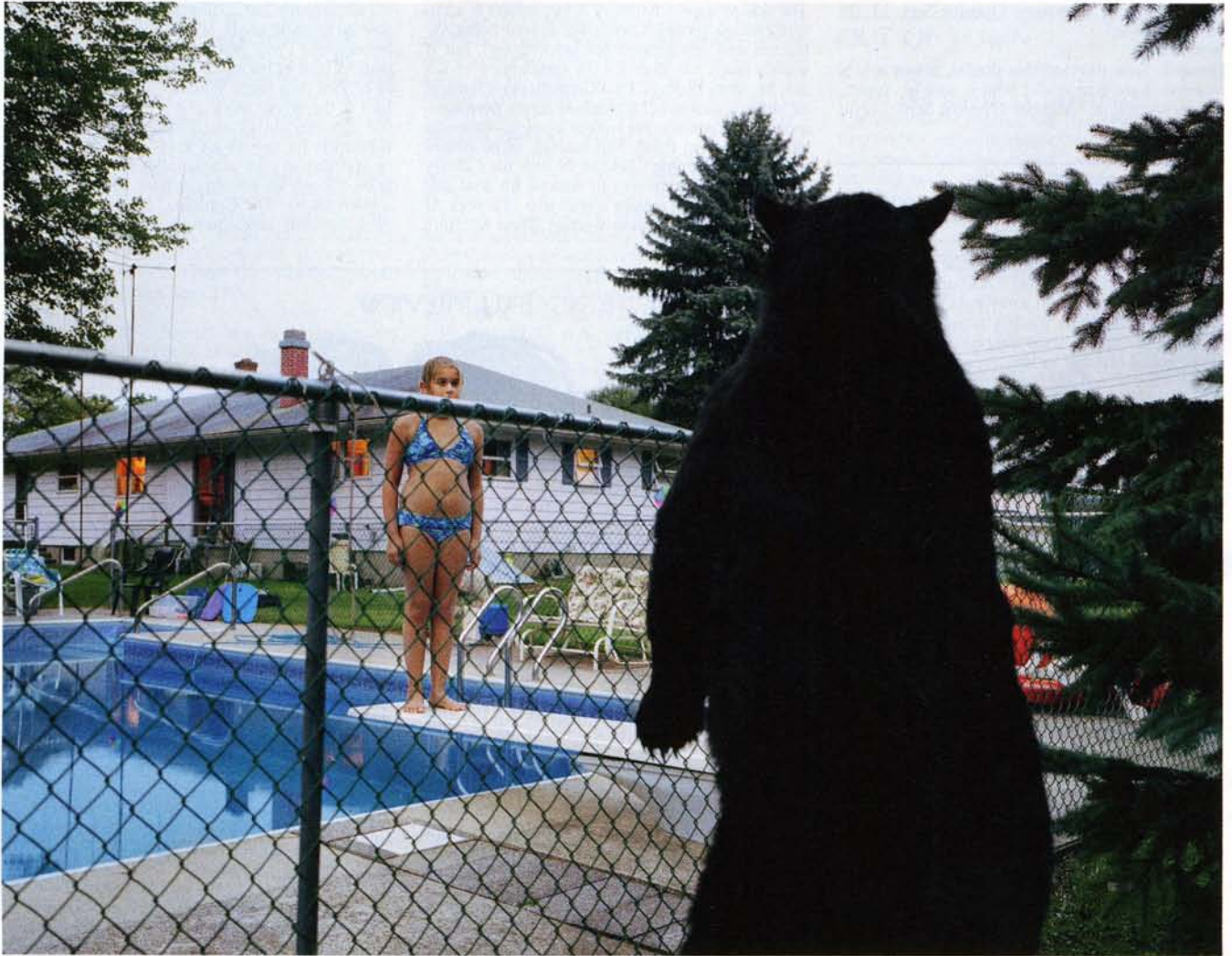
"Watering Hole," a photograph by Amy Stein, in her exhibition "Domesticated," at ClampArt.